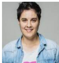
MJ Cachón MJ Cachón Consultancy